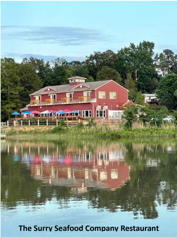
The Surry Seafood Company Restaurant

Enjoy the drive to Surry along Route 10 or Route 31. If your approach takes you across the James River on the Jamestown-Scotland Ferry – even better!